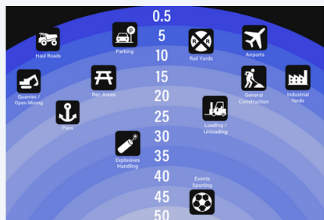
Recommended Illuminance (foot-candles)

More foot candles on your scene are better. What's important is the amount of light illuminating your scene, not the amount of light leaving the source.□